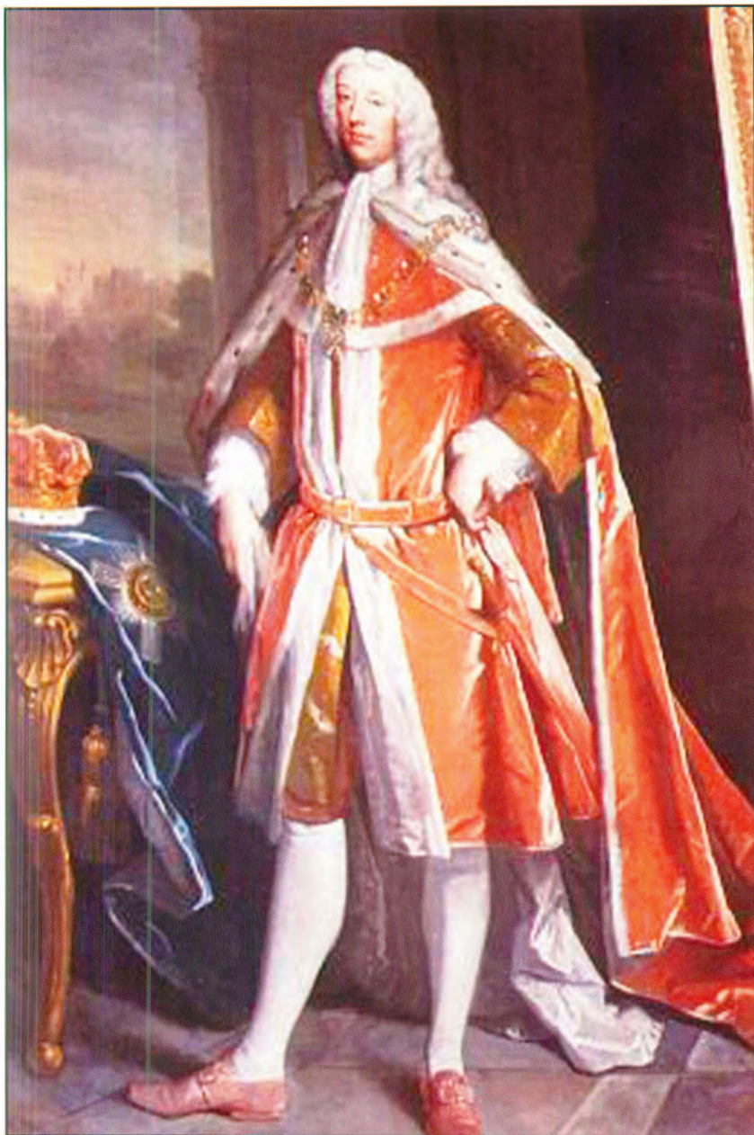
James Murray, 2nd Duke of Atholl, see page 104.