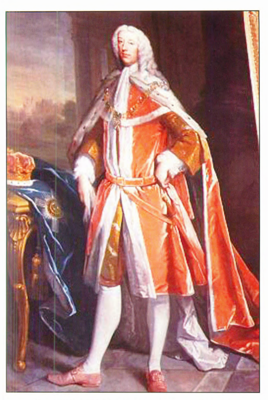
James Murray, 2nd Duke of Atholl, see page 104.