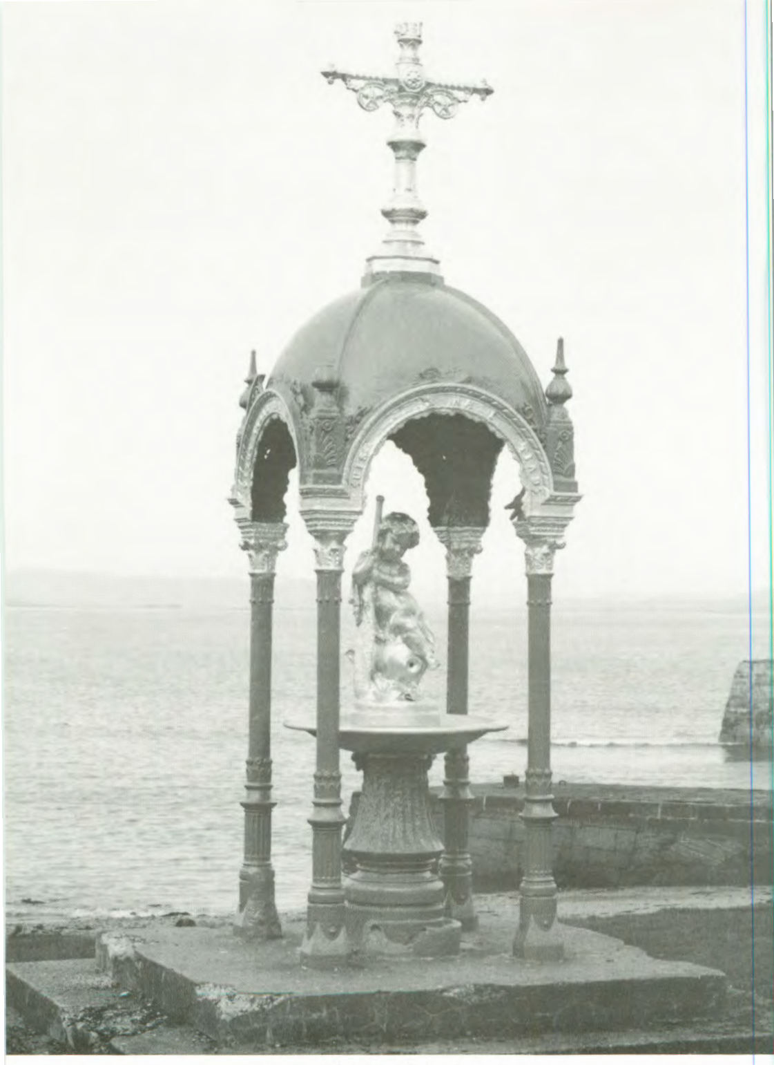
Cast-iron fountain, Portmahomack.