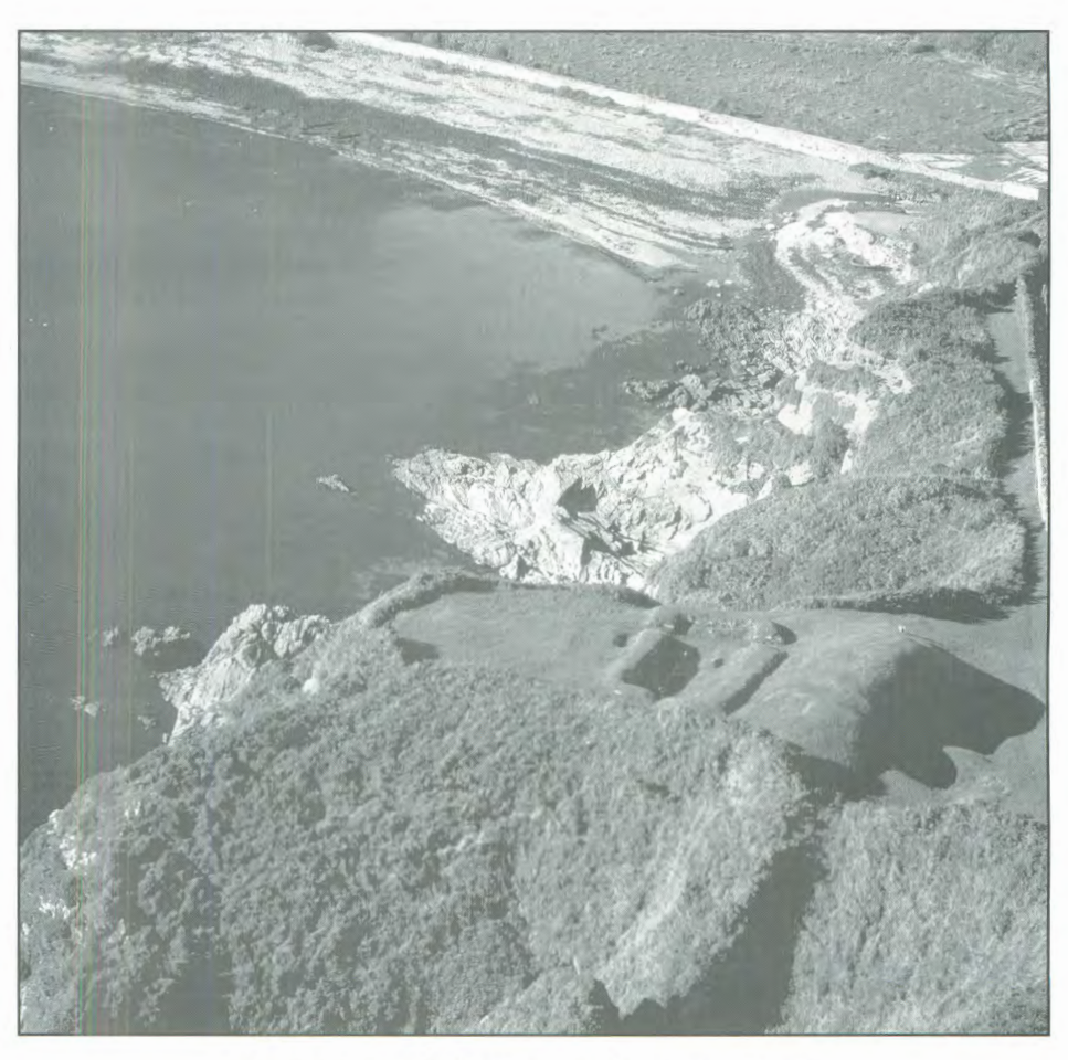
Figure 3: Aerial photograph of Cronk ny Merriu