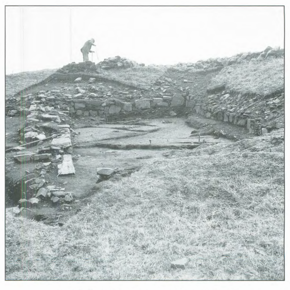
Figure 2: Excavation photograph of Close ny Chollagh.